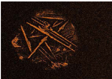
Electron microscope image of ammonium sulfate crystallized on the leaf surface after an application with a typical APG based non-ionic surfactant/ammonium sulfate blend.